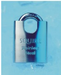
Arctic lock submerged in ice