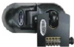
STH1 - Padbar CEN 6 rated

Sheds, garages, commercial vehicles, substations, perimeter gates, trailers, industrial premises, schools, clubs, storage units.