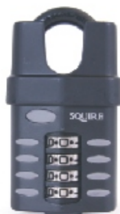
CP50CS - Closed shackle