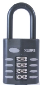
CP501.5 - Long shackle