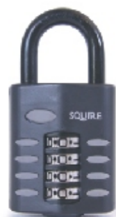
CP50 - Open shackle