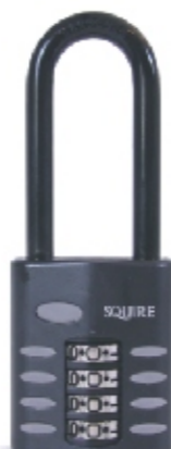
CP502.5 - Extra long shackle