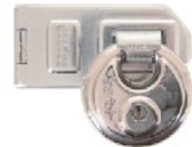
DCL1/DCH1 Lock and hasp set