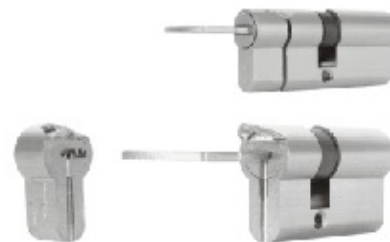
SnapSafe™ before and after attack

The range compliments our Standard and Restricted range of cylinders and also our SQUIRE Stronghold® padlocks