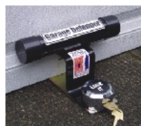
GARADEF - Garage Defender