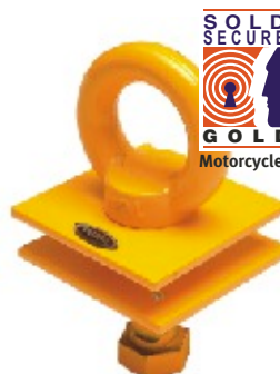
GA1 - Ground Anchor