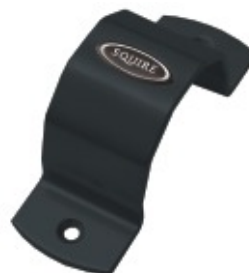
BWA2 - Wall Anchor