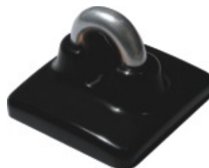
BWA1 - Wall Anchor