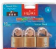
LP9STR - Rustproof