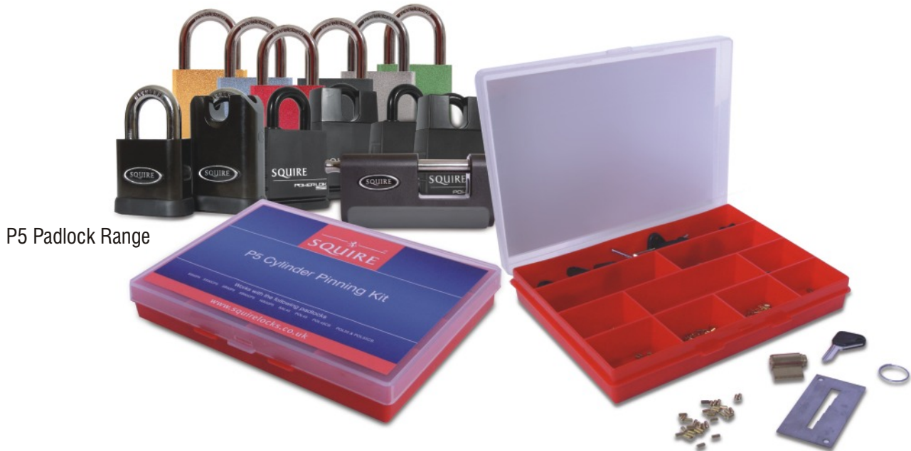
P5 Padlock Range

SS50P5 • SS50CP5 • WS50P5 • SAL40 • POL45, POL45CS, POL55 & POL55CS.