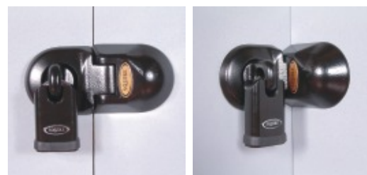
STH1 or 2 Padbar can be fitted flush or at right angles

Like the STH1, this heavy duty padbar has a robust casting for the hasp attachment plate and staple. Equally, the staple is designed to work with the 12.7mm shackle and the STH2 is recommended for use with the SS50 Stronghold ® range. Look for the padbar with the silver lens. Easy to fit.