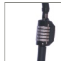
pull body back