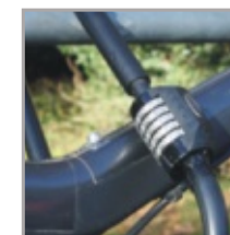
secure item to fixed object