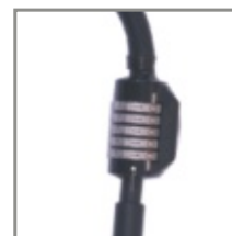
dial in code